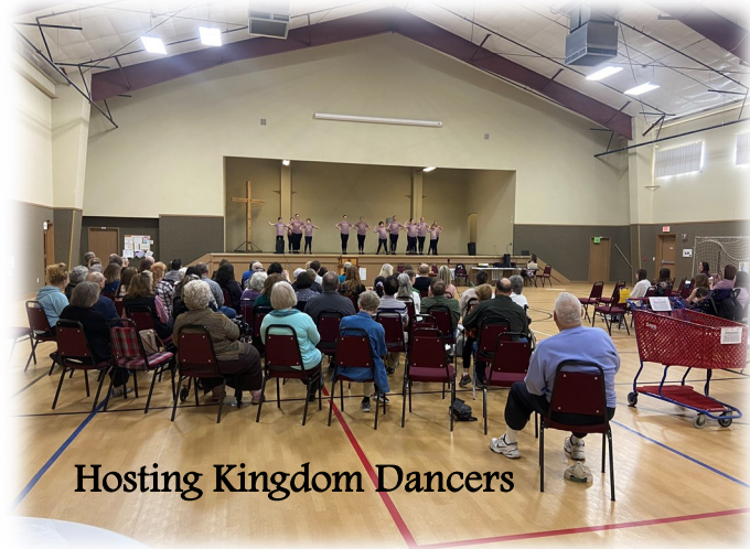
Hosting Kingdom Dancers