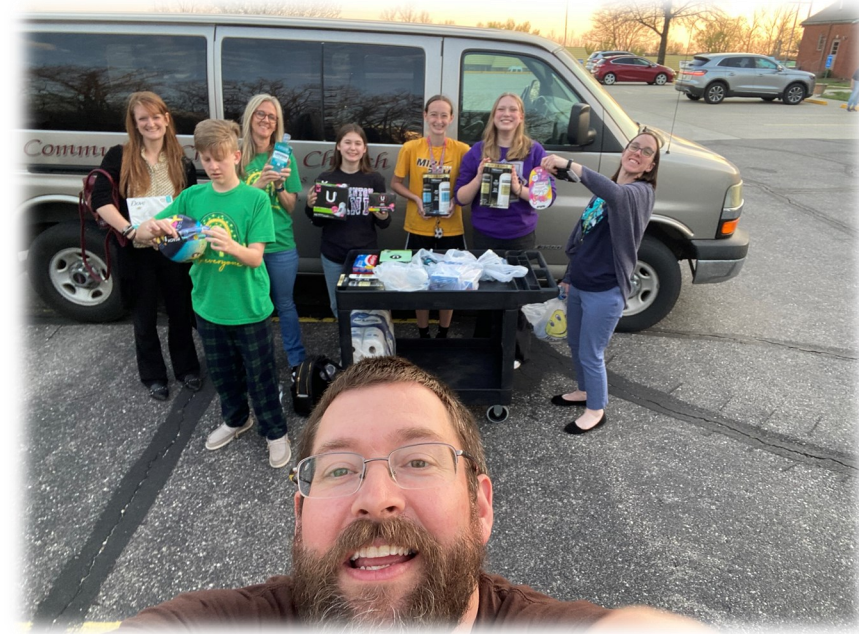
High School Youth Group Doing good deeds and having fun